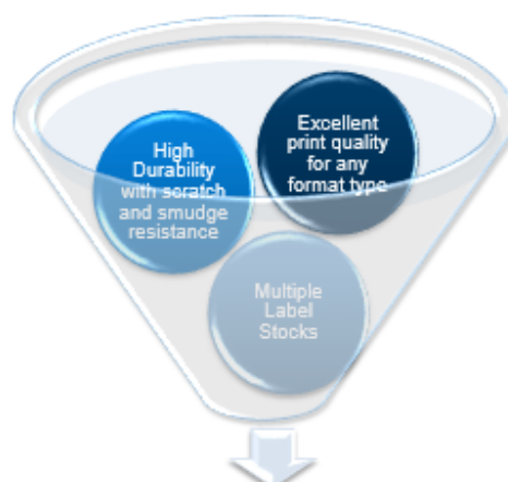
Resin-Enhanced Wax GP725 or High Mark Featuring CleanStart®

It is the first choice for short-lived, high volume applications such as shipping or WIP tracking and for markets that are using single substrate, paper label stock and similar products.